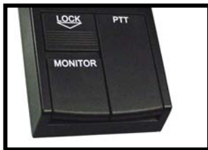
PTT lock function